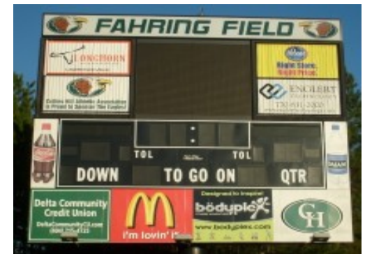
TOUCHDOWN CLUB MATRIX BOARD

Thanks in advance for your participation and see you at 7:00 p.m. (Collins Hill Theater) on Tuesday March 29th, 2016!