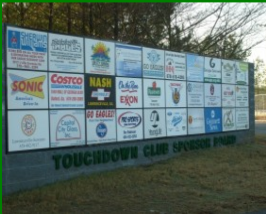
TOUCHDOWN CLUB SPONSOR BOARD

The Collins Hill Touchdown Club would like to invite you to participate in sponsoring the Eighteenth Annual Mr. Collins Hill Contest. Collins Hill High School, which opened in 1994, has grown to an enrollment of over 3,500 students and has established a name for itself in academics, in extra-curricular activities, and in the Gwinnett County Community.